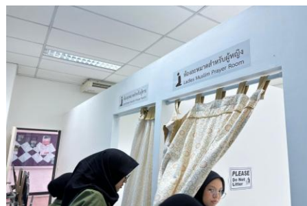
Figure 2. Prayer Room Inspection

men's and women's prayer room before it was cleaned and tidied up, are shown in Figure 3 and 4, respectively.