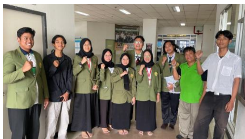
Figure 1. The Implementation Meeting

The outreach activity starts by meeting with several Thai students to coordinate the activities that will begin on Friday, July 19, 2024 (Figure 1).