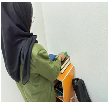
Figure 5. Tidied up the Quran area

were also checked. It was ensured that every corner of the room received sufficient lighting and proper ventilation to create a comfortable and serene atmosphere for prayers.